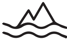
RUN PAST A BODY OF WATER