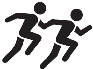
YOUR RUNNING BUDDY

You have until October 26, 2020 to complete the virtual scavenger hunt and must be registered for one of the Virtual Mankato Marathon races.