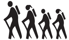
HOW YOUR FAMILY STAYS ACTIVE