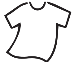
FAVORITE MANKATO MARATHON SWAG