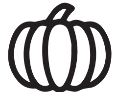
DECORATE A PUMPKIN